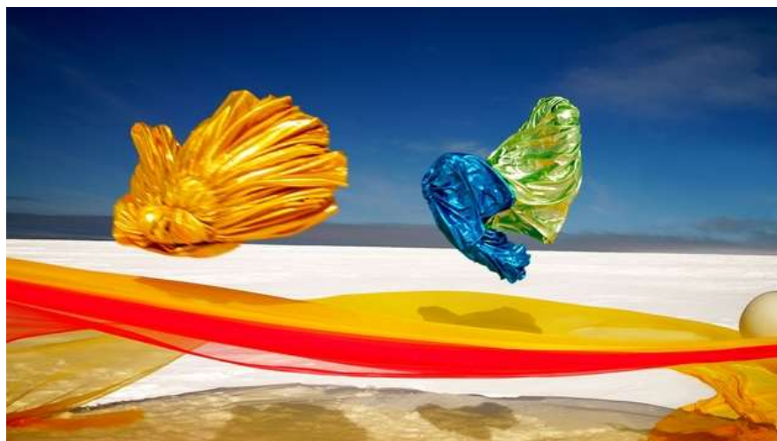
PHOTO: Seabourn Ovation's art collection will stir emotions. (photo courtesy of Seabourn)

WHY IT RATES: Art fanatics, rejoice! The Seabourn Cruise Line is adorning its new vessel with a world-class collection.—Donald Wood, Breaking News Senior Writer.